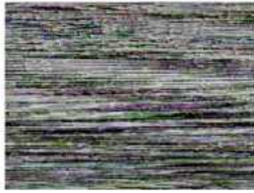
Screen shot of scrambled picture