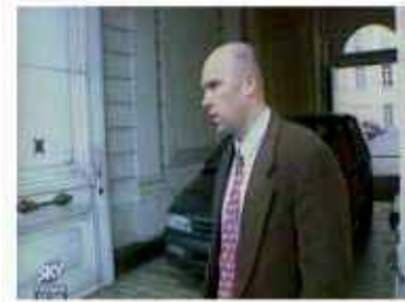
Screen shot of decoded picture