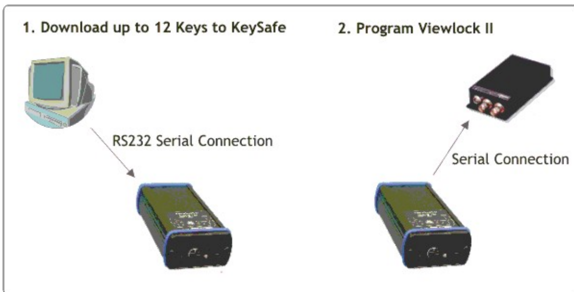
Application of KeySafe