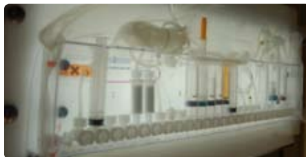
Assembly Verification in the Pharmaceutical industry

Scorpion Basic is used in a large number of assembly verification solutions. High reliability and flexibility are achieved by using Scorpion Basic, standard PCs and firewire imaging.