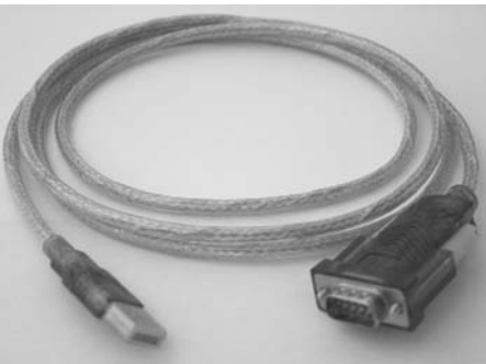
Converter Cable, 400 030