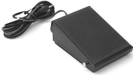
Footswitch, 400 020

Electronic Accessories specially developed for the VisiLED Controller MC 1500.