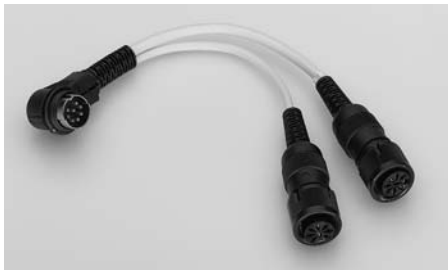
Y-piece, P/N 258 400