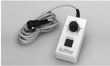
Remote control, P/N 258 402