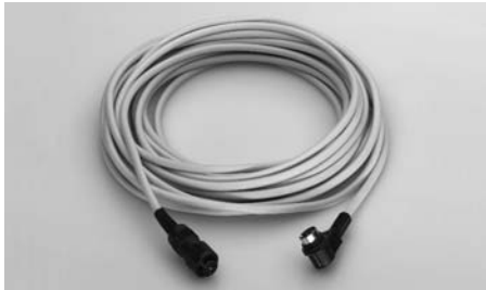
Cable extension, P/N 258 401