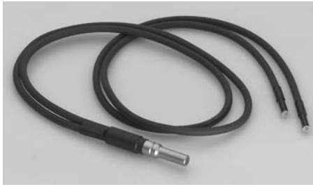
Flexible light guide 2 branch