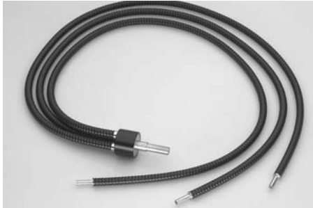
Flexible light guide 3 branch