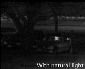
With natural light