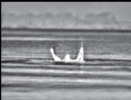
Person in water waving for help